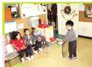
The role-play area became the MTR for the children to practice travel etiquette and payment through Octopus card.