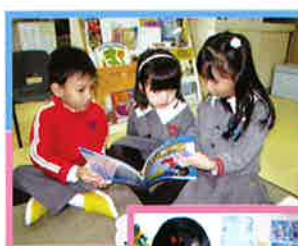
Using an atlas to research about the continents of the world before making a 3D paper mache globe.