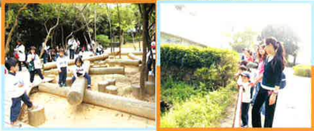
我們藉著親子活動，可以近距離親親大自然，從而感受到平靜和諧的氣氛。 Enjoying nature during the Upper Class picnic day.