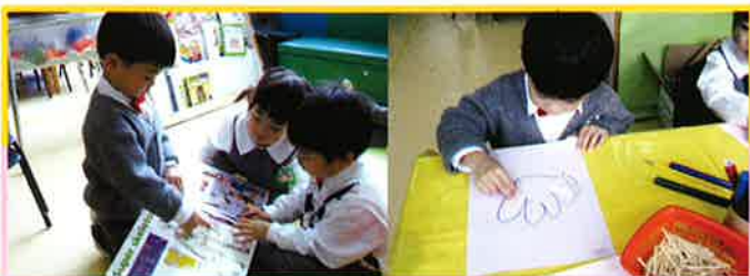
The children learnt that the bones we have inside are the reason why we are not "all floppy". They did book research and used sticks as pretend bones to form a hand.