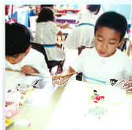
We are drawing our diagrams after experiments and fun games.