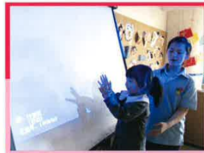
We learned about how our hands can entertain by creating different animals in our shadow puppet play.

幼兒透過觀察和不同的探索活動，加深認識手的特徵和功用，從而明白在日常生活中「手」扮演著重要的角色。