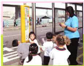
The children gathered information to plan a trip around Hong Kong. At the bus-stop they read the bus numbers to see where the bus was going.

The central idea of the inquiry was to understand that organizing a trip around Hong Kong involves careful planning and teamwork. The children learned about different types of transportation, the rules on public transport and different payment methods.