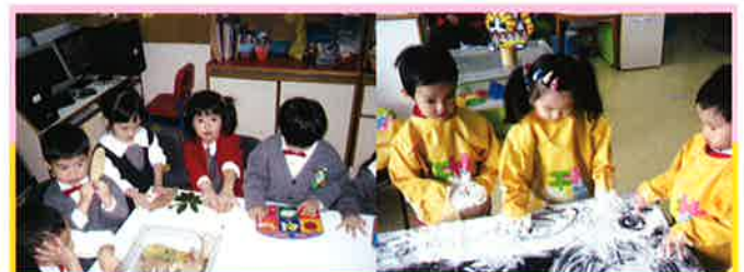
With our hands we can explore different textures and use language to describe how it feels to touch a rough leaf, soft silk or foamy shaving cream.