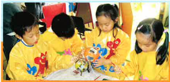
我們更利用報紙製作地球模型。 Making 3D paper mache globes out of newspaper.