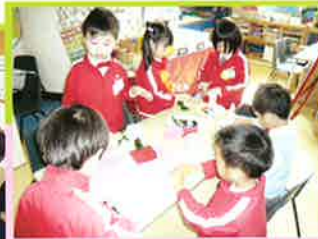
在參觀後，我們發現了在灣仔海旁有很多不同的船在航行，所以我們嘗試用不同的物料製作一艘船，並探索船怎樣可以浮在水面上？

After seeing so many boats during our outing to the Golden Bauhinia in Wanchai, we created our own boats using different recycled materials in our classroom. We wanted to see if we could create a boat that will float. We tested our creations by putting it in water to see if it passed the test.