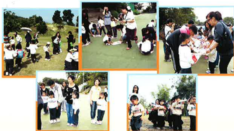
我們從各種遊戲中，能深入了解到循環再用的原則，而且也可以發揮出無窮的創意。 We can even play games with recycled materials!