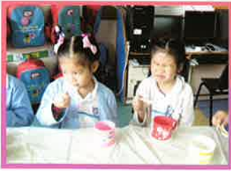
我們透過嚐味活動明白舌頭的功用，我們還認識了甜、酸、苦、辣、鹹這五種味道，最後我們還能說出自己最喜愛的味道。