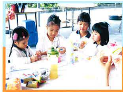
我們更配合「環保」的主題，自備可循環再用的食物盒及水壺，實行減碳生活。

We know that we need to reuse materials to preserve our Earth.