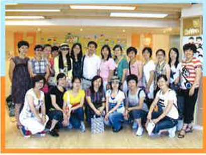
八月三日浙江省幼兒師資培訓中心的資深教育工作者到本園參觀，藉此了解香港的教學情況及學習環境。