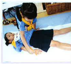
我們合作繪畫人體圖，然後寫上不同器官的名稱。