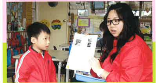
During our outing in Wanchai, we counted how many different types of transportation we saw. We also drew a picture of the things we saw at the Golden Bauhinia Square. When we came back to school, we shared our findings with one another.

The central idea of the inquiry was to understand that organizing a trip around Hong Kong involves careful planning and teamwork. The children learned about different types of transportation, the rules on public transport and different payment methods.