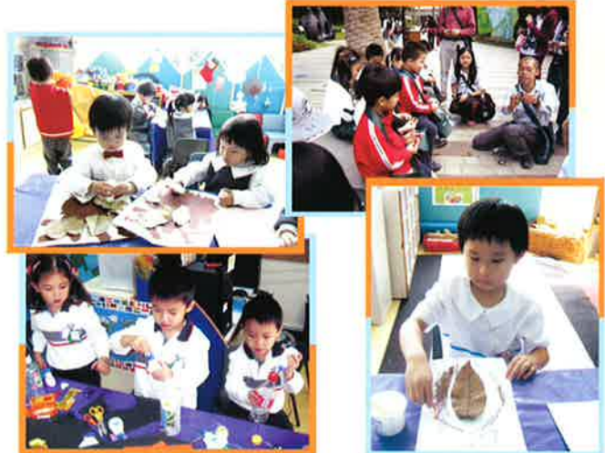
幼兒更從不同的途徑，實踐善用資源的理念，製作出不同的環保作品。 Incorporating natural materials into creative projects.