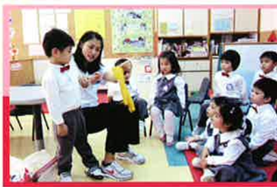
We also asked students to bring in items from home about their "hands" to show and share with their peers.