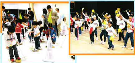
我們利用不同的環保物料製作出運動器材，如跳韻律操的棒子及模擬滑雪的工具。 For Sports Day, our pom-poms and games were made from recycled materials.

為了讓孩子日後能繼續享有地球上的自然資源，故此我們展開了不同的環保活動，來培養孩子對環保的意識及懂得珍惜地球資源。