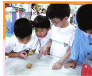
幼兒藉著實物來研究動物的眼睛結構。