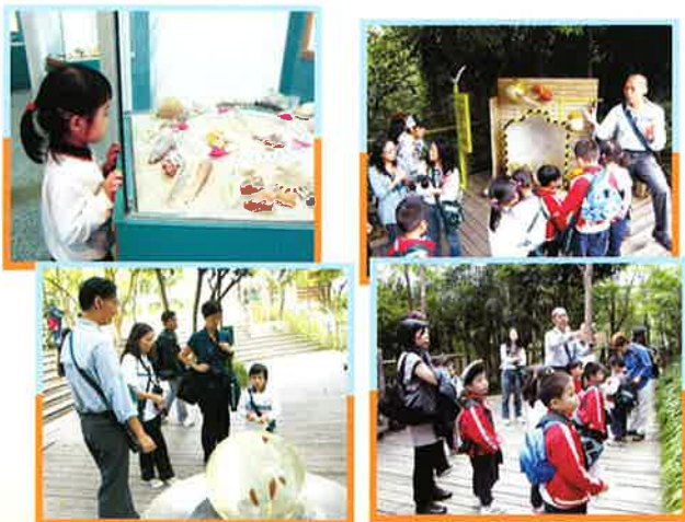
幼兒透過親身的體驗，擴闊了個人的知識領域外，還能珍惜大自然。