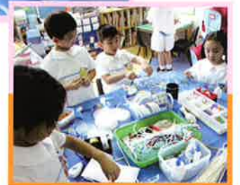
We created our own eyeglasses with a variety of recycled materials in our classroom. All of our hard work paid off because we had a fashion show where we modeled our spectacles to the class.