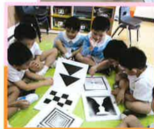
幼兒參考一些視覺圖形書籍後，便自行創作出不同的圖形卡。