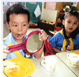
We looked in the mirror as we ate our food and observed the jobs of teeth, tongue and saliva.