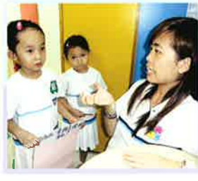
我們在學校進行訪問，希望取得第一手的資料。