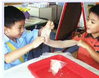
We used ties to represent our intestines. Food was squeezed through the ties. The liquid that came out of the ties represented the nutrients which are absorbed by our body.