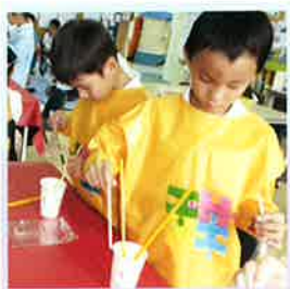
We investigated how food moves down the esophagus and enters the stomach. We used straws to represent the esophagus and plastic bags to represent the stomach.