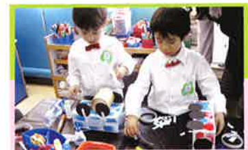
利用環保物料製作交通工具，探索車輪的形狀及紙張的軟硬。

幼兒想出不同的辦法，把自製的交通工具變成了相架，既環保又美麗，把“全家福”擺放在家中，多有紀念價值！