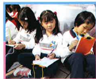
我們綜合不同的生活經驗，設計了一次可乘坐公共交通工具去參觀的旅程。(從海怡半島到尖沙咀)