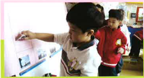
We voted to decide where we should go on our journey. There were a few options to choose from, but most of us wanted to go to the Golden Bauhinia in Wanchai.