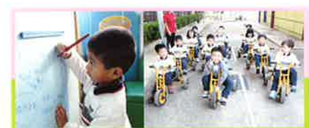
我們計劃一次旅程，要思考出發前的準備工作。