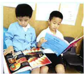
我們一起閱讀圖書，尋找有關消化系統的資料。