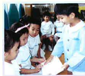
我們輪流介紹自己的牙齒圖，藉此了解牙齒咀嚼食物對消化系統的重要性。