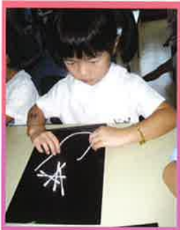
We used pipe cleaners and cotton wool buds to make 2D pictures of a skeleton.