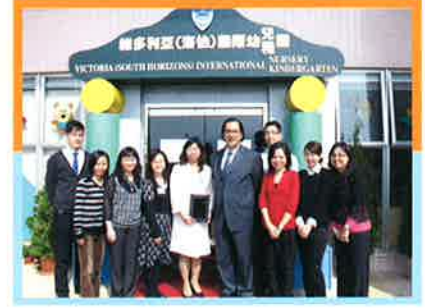
十一月二十四日澳門教育暨青年局負責人連同澳門中小學教師到本園參觀，為了解香港幼兒的學習情況及互相交流教學心得。