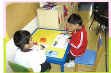
The students practiced addition in the Math Centre by flying airplanes from the airport to the sky and recording the operation.