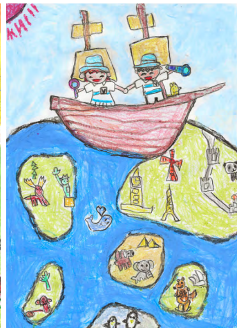
Isaac LAU (K2A2AM, HMT)