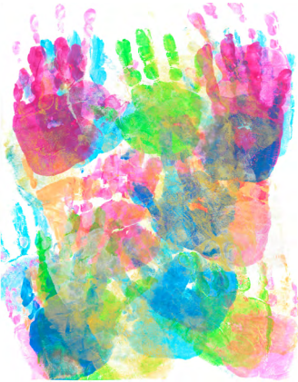
Arabella BILBEY (PNA2AM, HH)