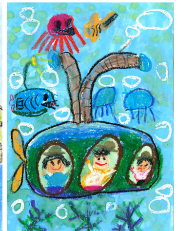
Wilfred YEUNG (K3AMPM, BV)