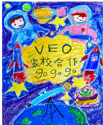
WONG Chi Chun (K2A3AM, HG)