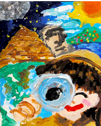
Bella TANG (PNA1PM, MK)