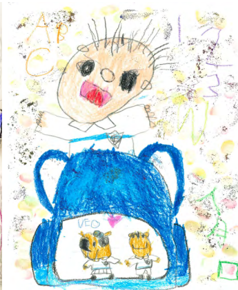
Orion WONG (K1A1AM, BV)