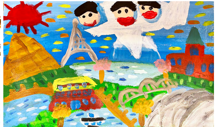
KONG Tsz Yu (PNA2AM, MK)