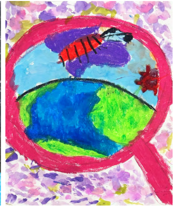
Iryna TAM (K1A1AM, MK)