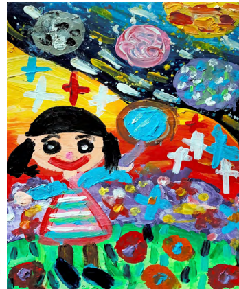
Mini AU Yui Tung (PNA2AM, HMT)