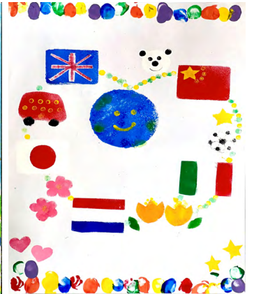
Sheldon TANG (PNA2PM, LK)