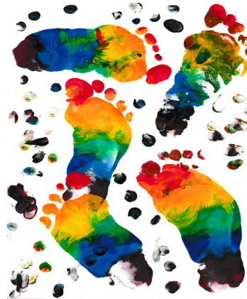
Charis TANG (PNA2AM, MK)