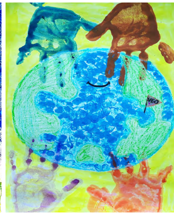
Chantelle NG (PNA1PM, HG)