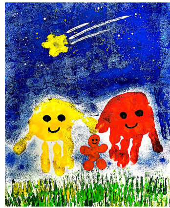
Theo TONG Ching Hei (PNA2AM, BV)