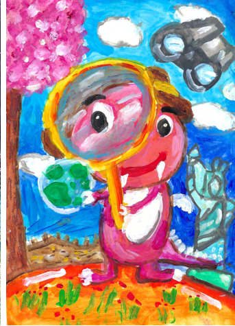
Moses CHAN (K2A1AM, HMT)