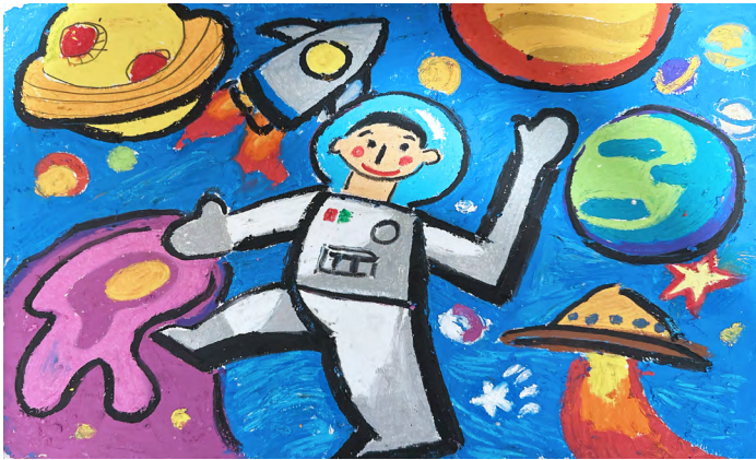
SUEN Yuk Shing (K3A3PM, HG)