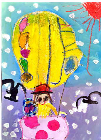
Zaina Primrose WONG (K1A5AM, LK)