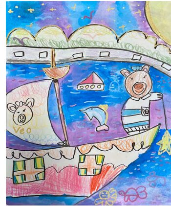
Scarlett LAW (K3A1AMPM, BV)